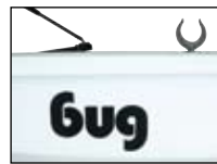
Oars and Oarlocks store within the hull