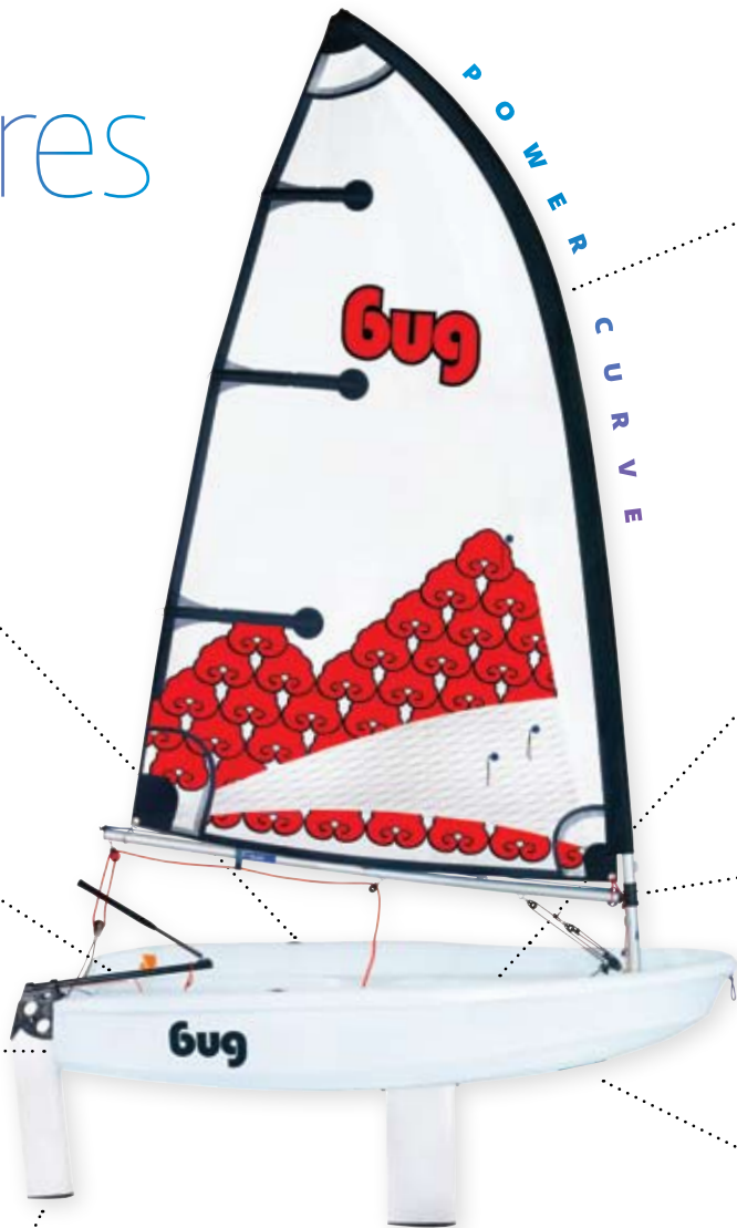
Floating Marine Grade Aluminum Centerboard