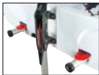
Optional Integral Carry Handles when purchased with wheel option