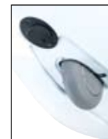
Optional Integral Wheel no need for a trolley!