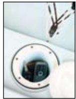
Secure Storage Port