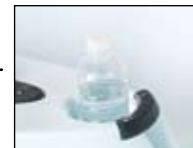
Integrated Water Bottle Holder