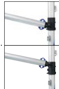
Two Position Gooseneck makes switch between the standard and Race rig a snap